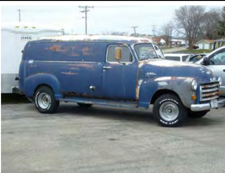
We think this might fit in the new Street Tuner Class!