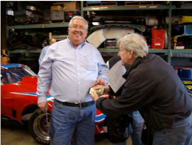
He is not paying to get his car passed...he's paying to get his competitors FAILED!

The 2009 Annual Tech Day has come and gone and WOW was it a great turn out. Not only was Advanced-Autosports packed to the rafters with Miata's that needed an annual tech but the line of cars coming through the doors was non-stop all day long.